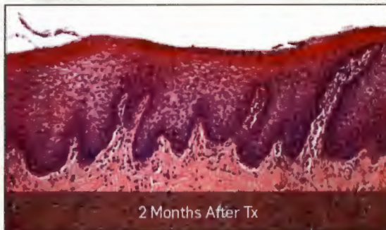
2 Months After Tx

Vaginal mucosa in the basal condition with a thinner epithelium.